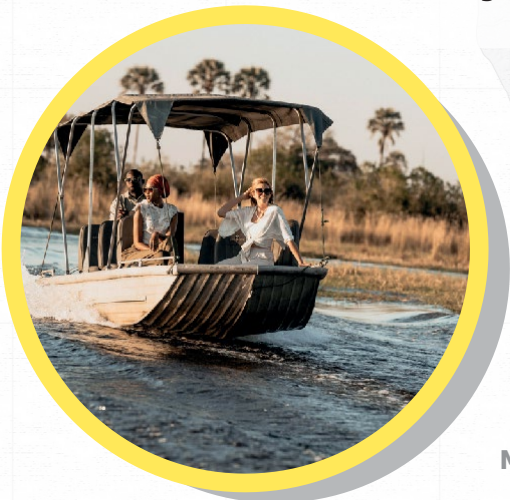
Mount Nelson Cape Town